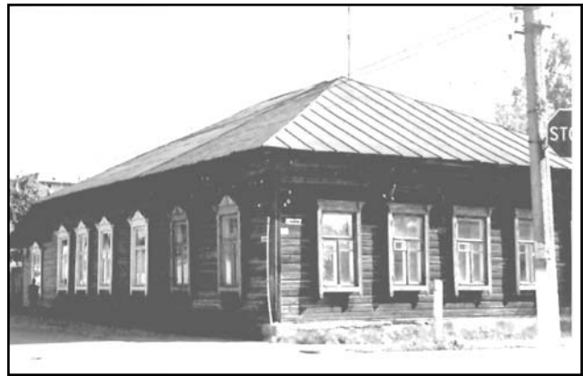
Fig. 3 - Yiddish Soviet school closed by authorities

Before the war, the Rechitsa Jewish eight-year school occupied a spacious one story 19th-century building at the intersection of Preobrazhenskaya (now Lenin) and Mikhailovskaya (now Karl Marx) streets (House No. 91). The school was surrounded by similar wooden structures more than a century-old. Rechitsa was home to many