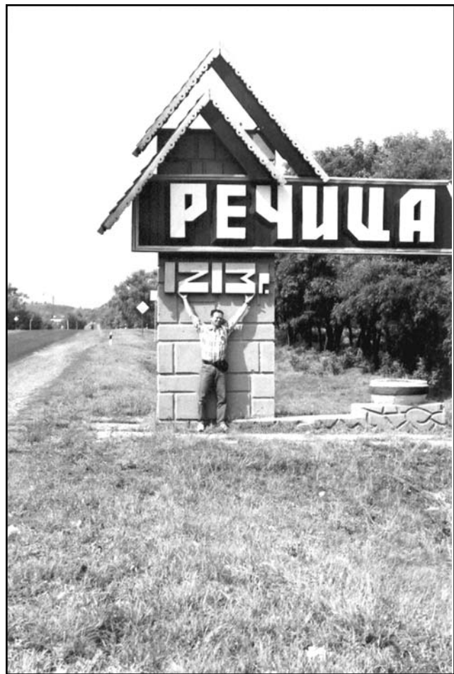
Fig. 8 - The author at Rechitsa's road sign

38 The damage was made good by the Rechitsa authorities, cf. Aviv no.2/1999.