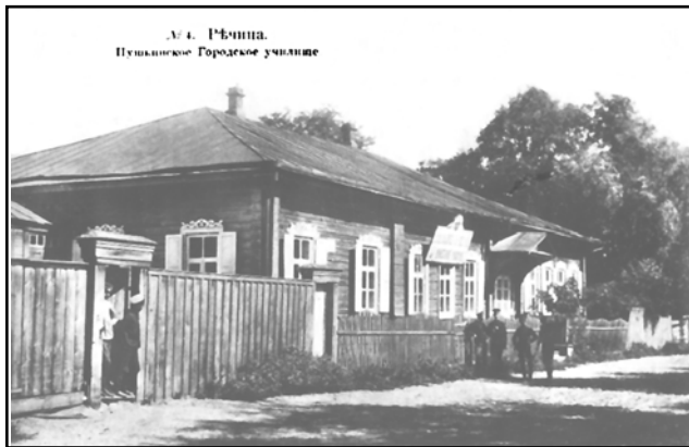
Fig. 5 - Pushkin College on Naberezhnaya Street