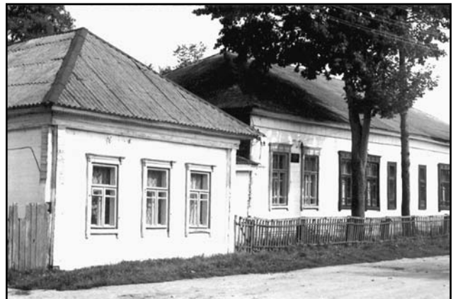
Fig. 4 - Local State Archive on Michurina Street

was never mentioned. Even posing such a question was considered unacceptable because according to Karl Marx any religion was like "opium for the people" and Jews were deprived of the synagogues allegedly at their "own request" and for "their own better use". Those who dared to protest were ostracized, fired and in some cases even faced arrest. The synagogues buildings were falling into decay and torn down one after another. Conformism, however, was not universal: some continued to observe the tradition. There were some minyanim left in Rechitsa, although without rabbis. There was a visiting mohel and when he was not available his duties were performed by Yehuda Pinsky, Elya Tsvilin, and Zasepsky. The authorities resented these activities and they tried to ban them and imposed heavy