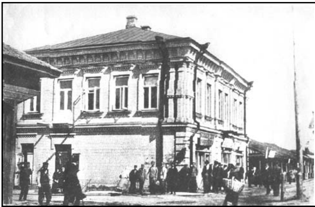
Fig. 2 - Womens School in Rechitsa, 19th century

As mentioned above, the Merchants' Synagogue located at the intersection of Lenin and Uritsky streets was a large two-storey wooden house of rare beauty. It had high ceilings and very large windows of distinctive shape. In the late 1920s the building housed a workers' club and the Blue Blouse Society. Its members staged musical-drama and